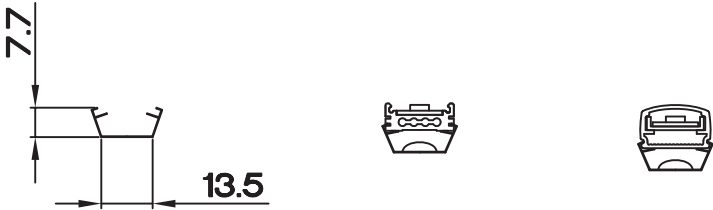
Stainless Steel Adjustable Bracket